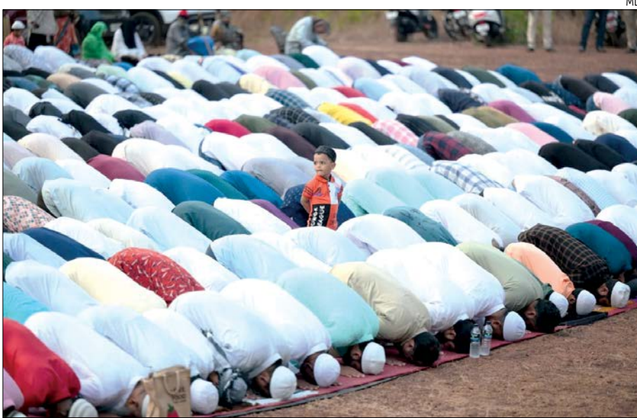
A boy observes the proceedings of Namaz being offered on the occasion of Eid-ul-Fitr at Bicholim, on Monday