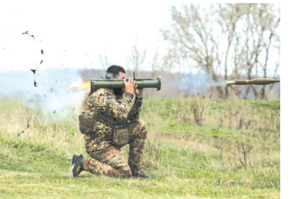
A Ukrainian serviceman improve his tactical skills at a training camp in an undisclosed location in eastern Ukraine, amid the Russian invasion of Ukraine

ported that Russia fired 111 exploding drones and decovs in the latest wave of attacks overnight into