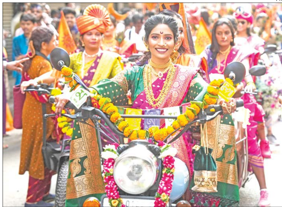
Women dressed in traditional attire ride motorcycles during a procession on the occasion of Gudi Padwa festival, the beginning of the Hindu New Year, in Mumbai, Maharashtra, on Sunday