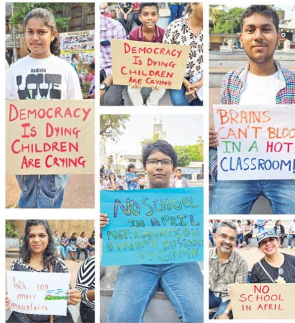
Students hold placards with slogans, adding to the growing chorus of opposition to the govt's move to start the new academic year on April 7

Parents passionately voiced concerns about the heat, lack of infrastructure,