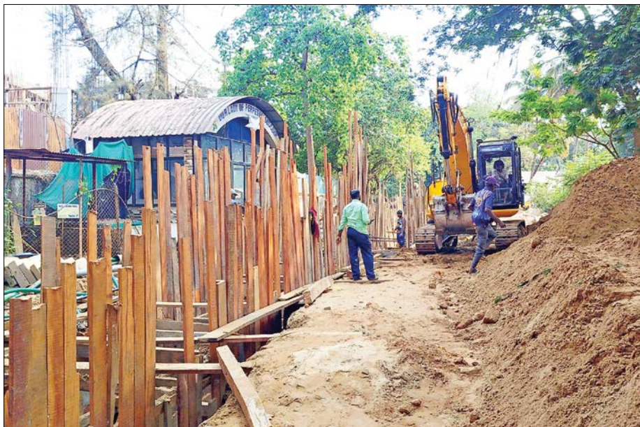
The road at Taad Maad, St Inez continues to be in a deplorable condition. (Top right) The rubble along the incomplete road near the Panjim Police Station. (Below) The incomplete concrete road near Rua de Ormuz

ing the one from Cafe Bhonsle to Mascarenhas Building are left open with poorly patch work and incomplete drainage system. The roads which are left incomplete include General Bernardo Guedes road (from municipal market to Geeta Bakery), M G Road (Mascarenhas building, Delhi Darbar, Hotel Vinanti), Atmaram Borkar Road (EDC Limited, behind Goa College of Pharmacy), and Rua Ismael Gracias (near Signal Training Centre).