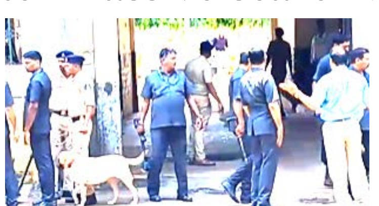
A sniffer dog deployed at the Police Headquarters in Panjim

The DGP's office received a bomb threat via email in the morning, prompting a massive search operation at the headquarters. Goa State Fire and Emergency Services along with the Bomb Disposal Squad, thoroughly searched the premises but found nothing suspicious.