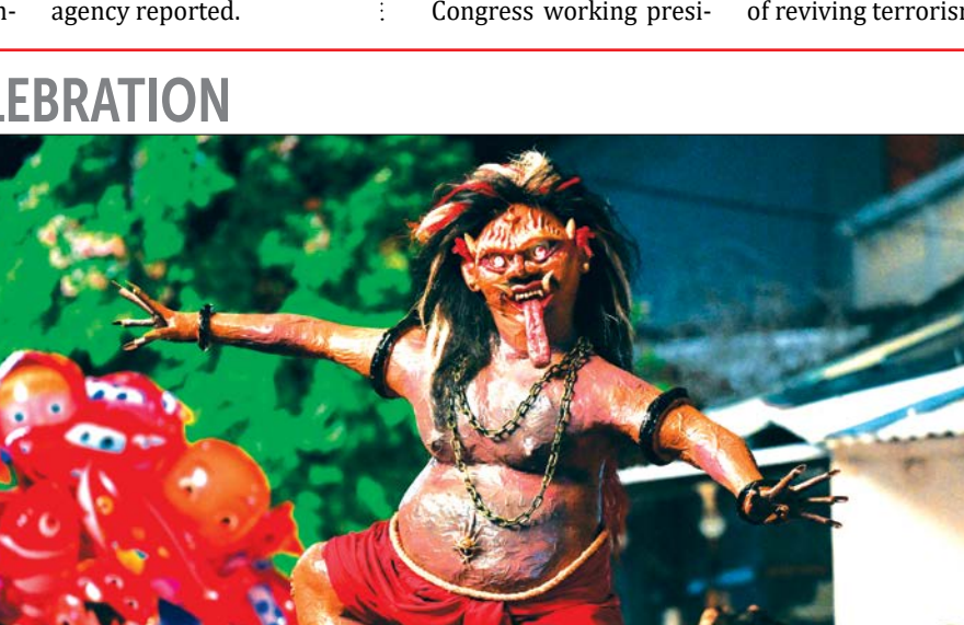
Balinese people carry an 'Ogoh-Ogoh' effigy during a parade on the eve of 'Nyepi' in Badung, on Indonesia's resort island of Bali, Indonesia

The BJP also held protests in Muthi against Pakistan, accusing it of triggering terror acts in the Jammu region with the aim of reviving terrorism.