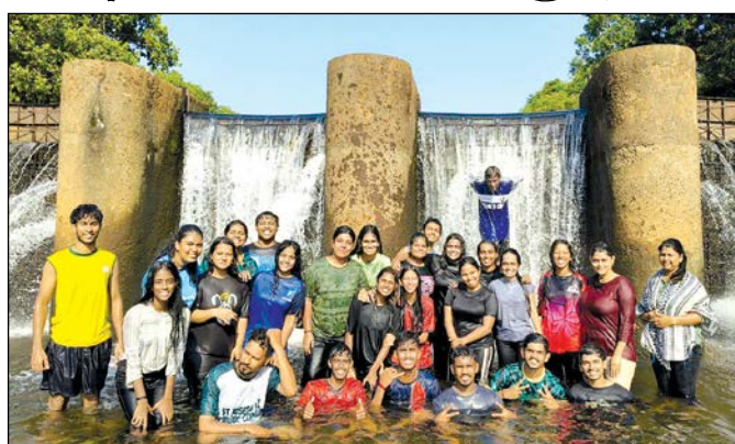
region as it supplies water to many kullagars and eco-farms that line

The river holds historical significance for the Dabal-Codli