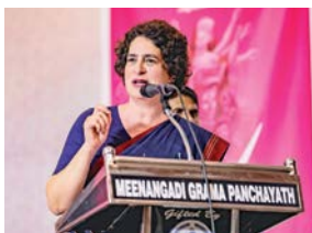
Congress General Secy and MP Priyanka Gandhi Vadra during the inauguration of Vanitha Sangamam at Meenangadi, in Wayanad district, Kerala