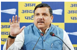
Senior AAP leader and Rajya Sabha MP Sanjay Singh addresses a press conference at the party office in New Delhi