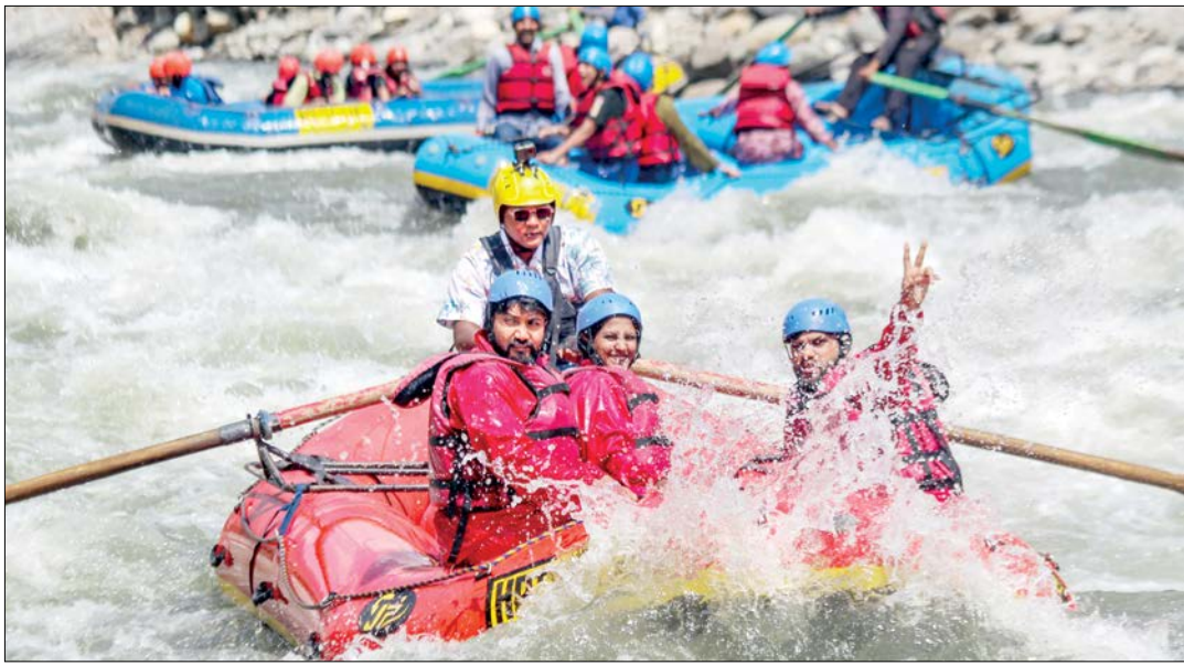
Tourists engage in rafting over the rapids of the Beas river, at Manali, in Kullu district, Himachal Pradesh, Thursday