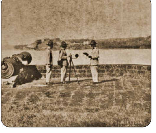
VINTAGE VIEWS OF MANDOVI RIVER TOWNS