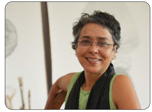
THE WEIGHT THAT WOMEN CARRY

GenZ's handwriting: A dying skill in a digital age