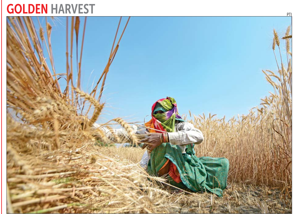
A famer harvests wheat crop, at Lal Gopalganj in Prayagraj, Uttar Pradesh

In California, police said a counter-protester was arrested on Saturday after activating a stun gun during an anti-Musk demonstration outside a Tesla dealership near downtown Berkeley. Nobody was hurt. The 33-year-old man was awaiting charges on Monday.