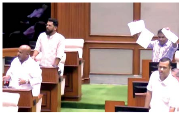
Opposition MLAs demand discussion on Akshay Patra