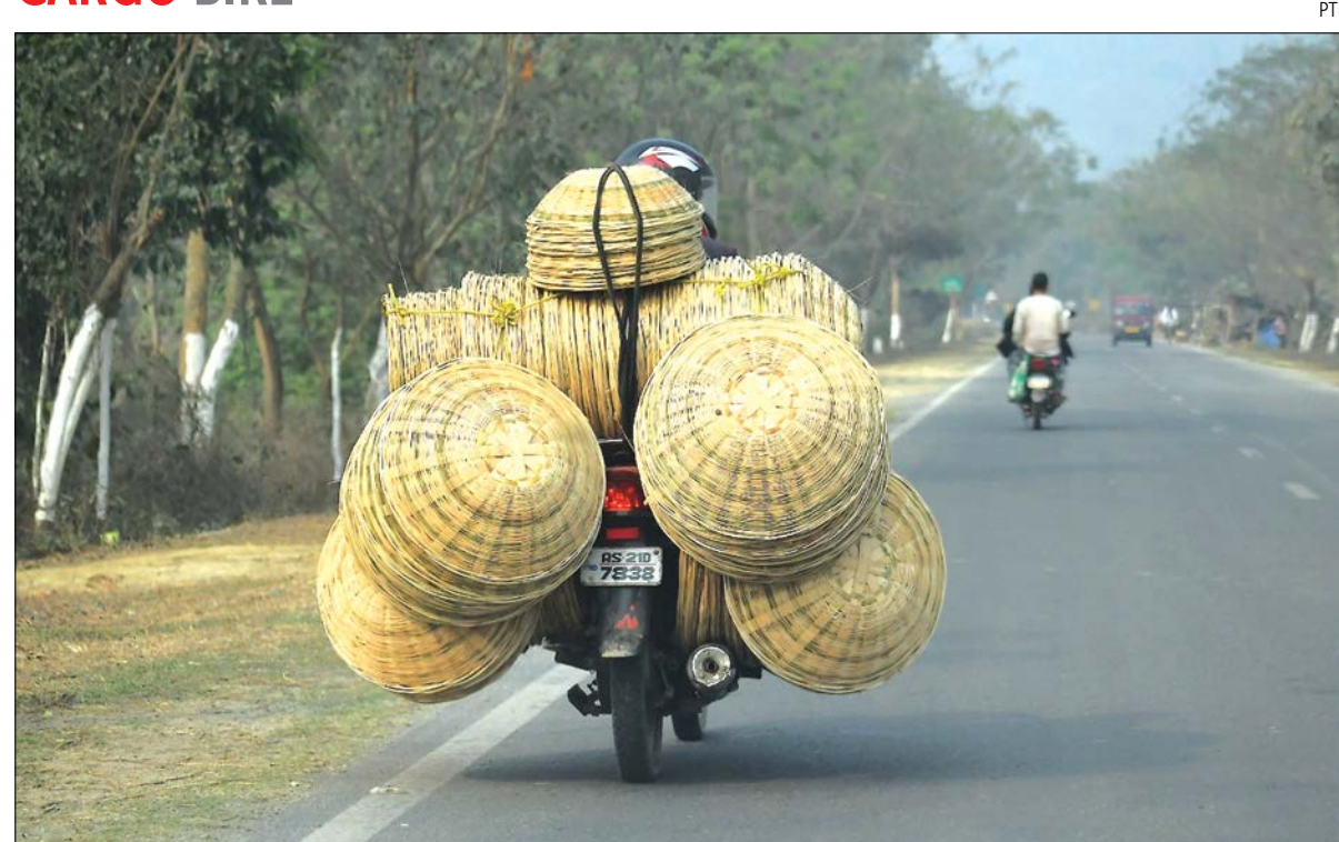
A vendor transports dozens of large bamboo baskets while balancing precariously on a two-wheeler, in Morigaon