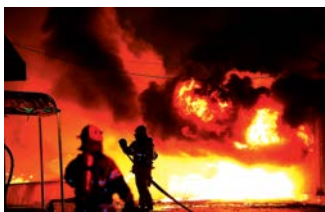
Firefighters extinguish a fire at a factory building that has been engulfed in a wildfire in Uiseong, South Korea