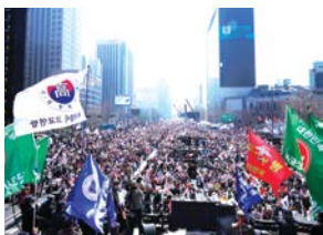
Supporters of impeached South Korean President Yoon Suk Yeol stage a rally to oppose his impeachment in Seoul, South Korea