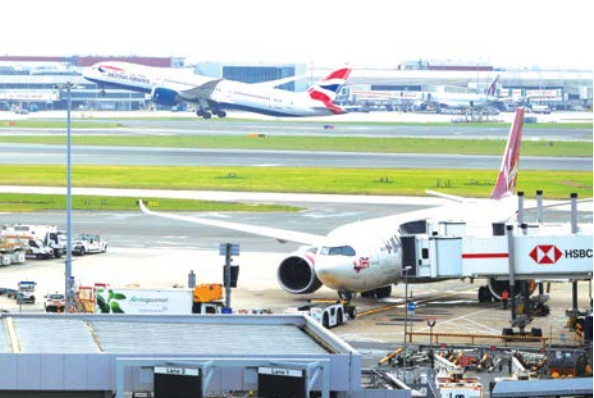
A British Airways plane takes off as Heathrow Airport slowly resumes flights after a fire cut power to Europe's busiest airport in London

Inconvenienced passengers, angry airlines and concerned politicians all want answers about how one seemingly