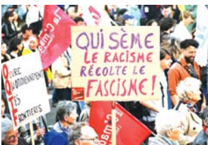
Protesters hold a sign reading "Who sows racism reaps fascism" during a demonstration on Place de la Republique in Paris