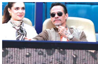
Musician Marc Anthony (R), sits courtside with his wife Nadia Ferreira (L), during the Miami Open tennis tournament, in Miami Gardens, Florida