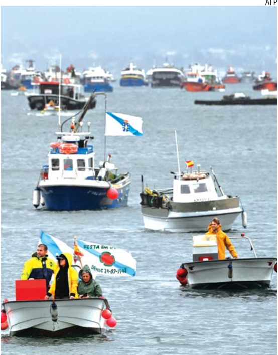
Fishing boats sail during a demonstration against a projected wood pulp mill by Portuguese pulp and paper industry company Altri, in Pobra do Caraminal, northwestern Spain

PARIS: A French court on Friday sentenced a French jihadist to life in prison for holding four journalists captive more than a decade ago in war-torn Syria. Mehdi Nemmouche, 39, was convicted of having held the French reporters hostage for the Islamic State jihadist group from June 2013 to April 2014. The sentence carries a minimum term of 22 years before he is eligible for parole. All four journalists during the trial said they clearly recognised Nemmouche's voice and manner of speech as belonging to a so-called Abu Omar, who terrorised them and made sadistic jokes while they were in captivity. Nemmouche denied ever being their jailer, only admitting in court that he was an IS fighter in Syria. From the beginning of the trial last month, he has claimed only to have fought against the forces of former president Bashar al-Assad, who Islamists previously linked to Al-Qaeda helped topple in December.