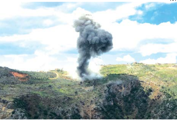
Smoke billows from the site of Israeli artillery shelling that targeted the area of the southern Lebanese village of Yohmor

Israel had said that it would respond "severely" to the attack from Lebanon early Saturday morning,