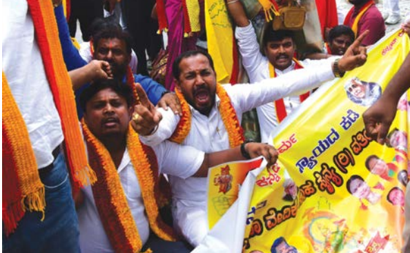
Pro-kannada activists raise slogans during their protest at Town Hall amid statewide bandh, in Bengaluru

In several parts of the state, pro-Kannada groups took to the streets, staging protests and urging shop-