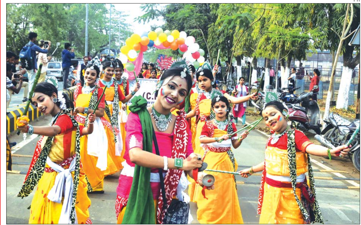
Children dance during the 'Dol' festival procession, also known as 'Dolo Jatra', at Dharmanagar area, in North Tripura district