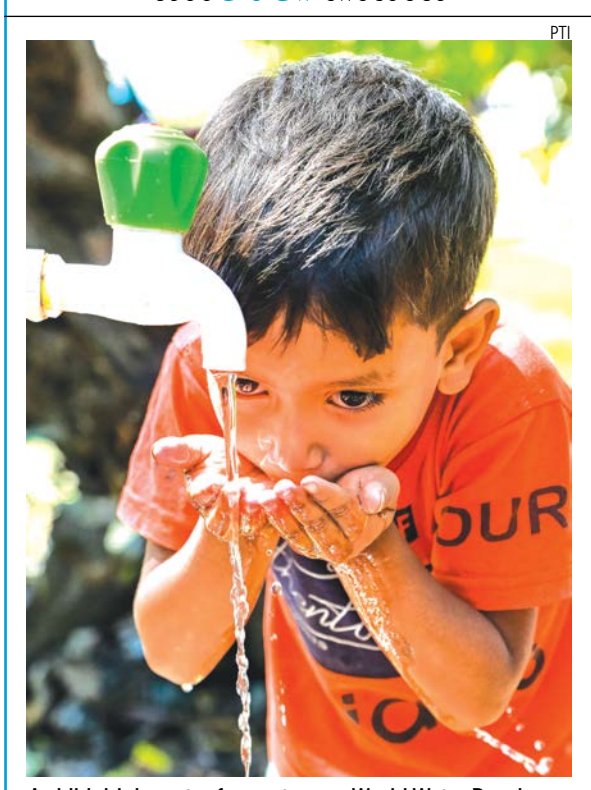
A child drinks water from a tap, on World Water Day, in Nadia, West Bengal