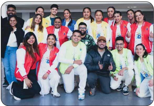
DANCERS OF GOAN ORIGIN SHINE AT FLAME 2025 IN WEMBLEY