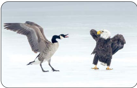
SYMBOLISM OR WILDLIFE IN BATTLE? CANADIAN MERVYN SEQUEIRA CAPTURES THE RIGHT SHOTS