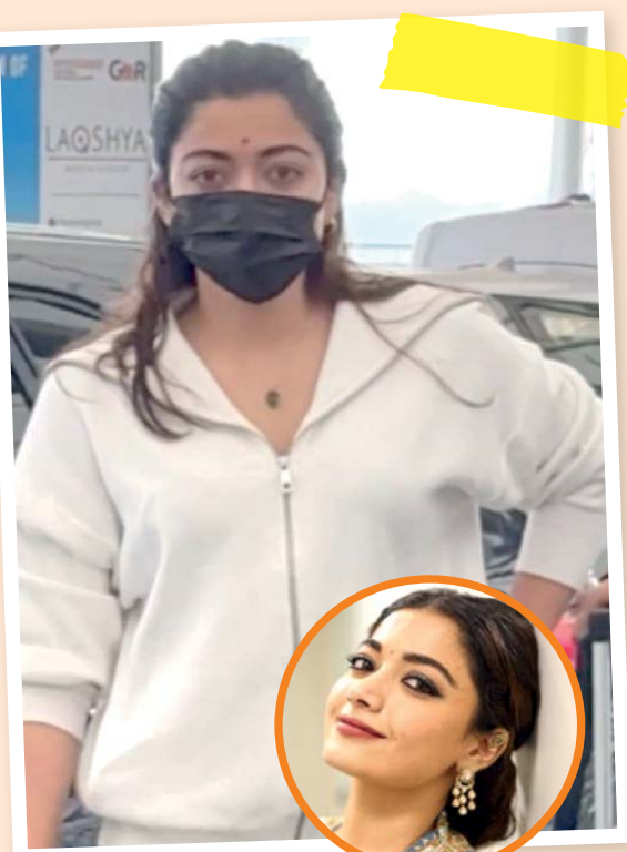
Rashmika Mandanna effortlessly balancing style and comfort with her airport look. The 'Pushpa 2' star was recently spotted wearing a cozy white sweatshirt paired with black trousers, exuding casual chic vibes