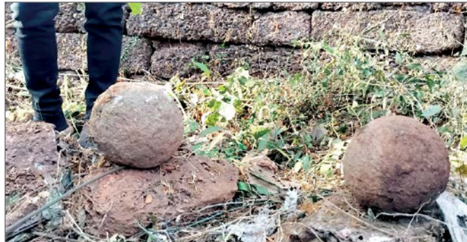
Cannon balls and arsenal which were found near the ruins of Five Wounds of Christ Church