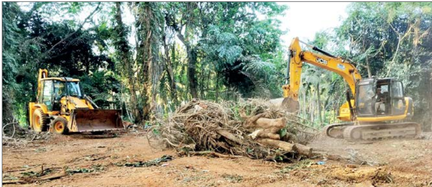
Excavation work being carried out using earthmovers and trees felled at the site

Police complaint alleging illegal construction opposite Bom Jesus; Tourism Dept accused of felling trees for shopping mall construction