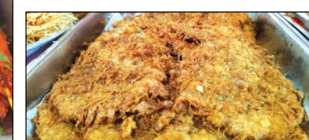
PICS: ELSA ANGEL ROSE