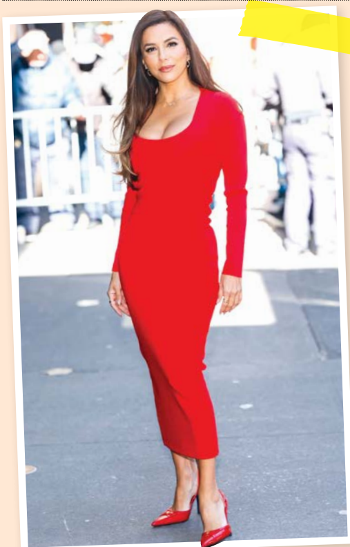
Eva Longoria gets fired up in red body-con dress with scoop neckline for 'Good Morning America' appearance