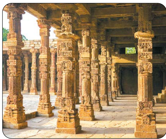
CULTURAL TRAVEL: EXPLORING INDIA'S LESSER-KNOWN HERITAGE SITES