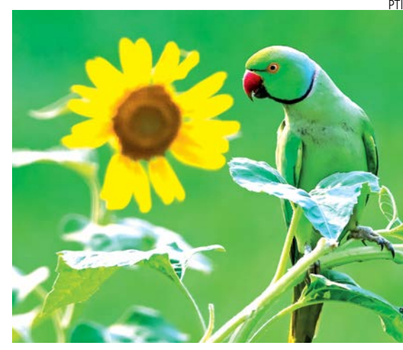
A parakeet perches on a sunflower plant on a spring morning, in Nadia, West Bengal