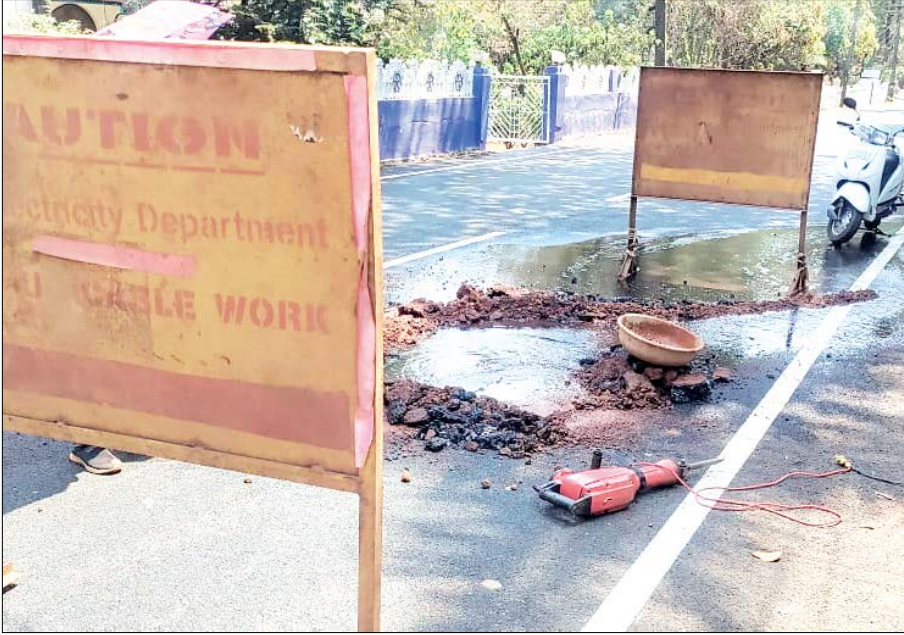
Workers digging up a freshly hotmixed road in Marna-Siolim to repair an underground cable accidentally damaged a water pipe, wasting hundreds of litres of water