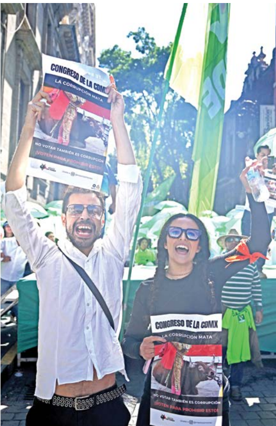
Anti-bullfighting activists celebrate outside the Mexico City Congress after an initiative to ban bullfighting was approved in the capital. Legislators in Mexico City, home to the world's largest bullring, on Tuesday voted to ban bullfights in the capital where the animals are killed or wounded