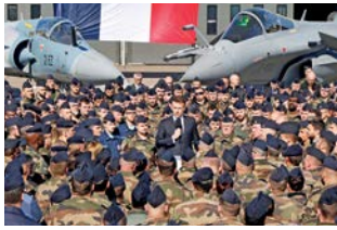
French President Emmanuel Macron speaks to soldiers at the Luxeuil-Saint-Sauveur airbase, in Saint-Sauveur, France