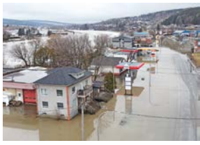
A convenience store and a gas station are flooded from the Chaudiere river in Beauceville, Quebec, Canada