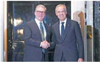
Canada Prime Minister Mark Carney is greeted by British Prime Minister Keir Starmer as he arrives in London