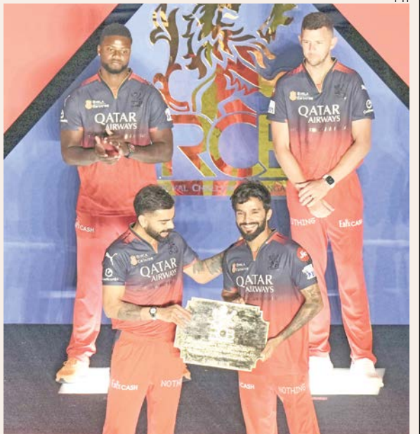
Royal Challengers Bengaluru's Virat Kohli presents a shield to skipper Rajat Patidar during the RCB Unbox event at M Chinnaswamy Stadium, in Bengaluru, on Monday