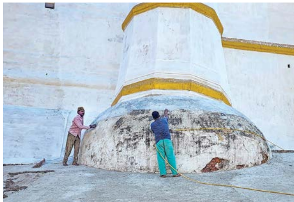
Workers whitewash the outer wall of the Shahi Jama Masjid, in Sambhal district, Uttar Pradesh

The Sambhal district has been tense since riots broke out on November 24 last year during protests against a court-ordered survey of the Mughal-era Shahi Jama Masjid. The mosque has been at the centre of a major row after a petition claimed that it was the site of an ancient Hindu