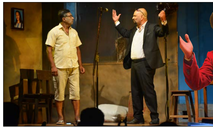
KA's 50th 'A' Group Competition 2024-25 'Varear Ubtolo Kapus'