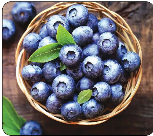
SPRING FOODS: NATURE'S BEAUTY BOOSTERS