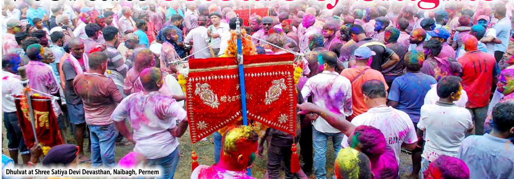
Dhulvat at Shree Satiya Devi Devasthan, Naibagh, Pernem

Shigmo or Holi is in full swing as the beating of dhol and taso is echoed all around the Goan cities, towns and especially the villages, where the festival is organised true to its ethnic character