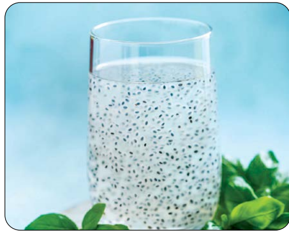
FASCINATING BENEFITS AND USES OF BASIL SEEDS