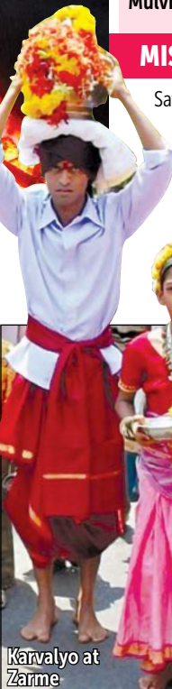
Karvalyo at Zarime