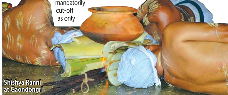
Shishya Ranni at Gaondongri

Strict vigil is kept in the villages where Gade festivals are organised. All illumination are mandatorily cut-off as only