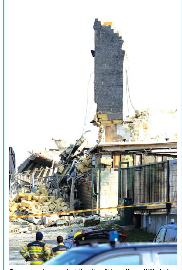
Rescue workers work at the site of the collapse Wilhelmina observation tower in Valkenburg, southern Netherlands. The observation tower on the Heunsberg, a national monument, is a well-known attraction in the South Limburg town