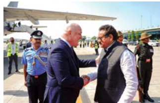
New Zealand Prime Minister Christopher Luxon being received by MoS SP Singh Baghel upon his arrival, in New Delhi