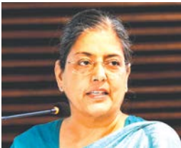
Competition Commission of India chairperson Rayneet Kaur speaks at CCI's 10 th National Conference on Economics of Competition Law, in New Delhi