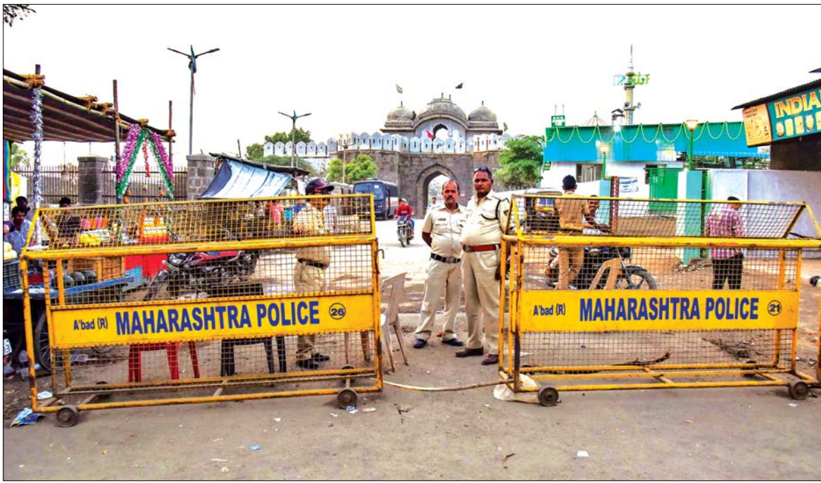
Security outside the Mughal emperor Aurangzeb's tomb in Aurangabad, Maharashtra, on Sunday