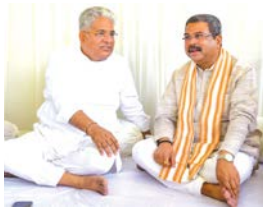
Edu Minister Dharmendra Pradhan meets Union Minister Bhupender Yadav to pay tribute to his revered father and console the bereaved family, in Gurugram