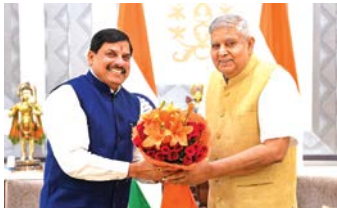
Madhya Pradesh Chief Minister Mohan Yadav meets Vice President Jagdeep Dhankhar in, New Delhi