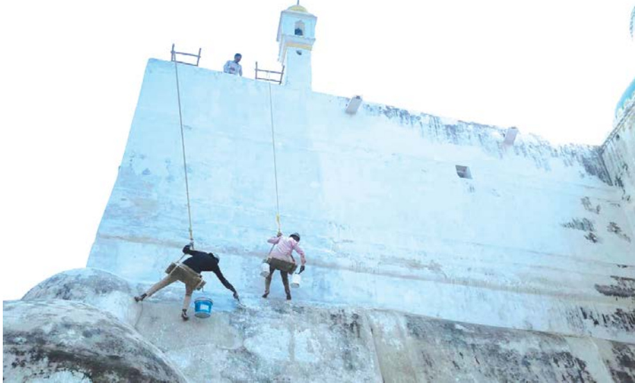
Labourers whitewash the outer wall of the Shahi Jama Masjid in Sambhal, Uttar Pradesh, on

Following the high court order, an ASI team carried out measurements and assessments on March 13.