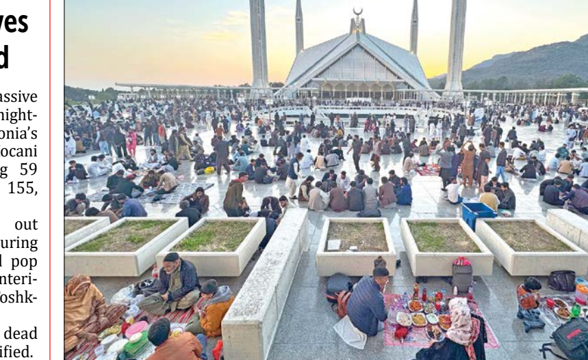
People wait to break their fast during the Muslim fasting month of Ramadan, at grand Faisal Mosque, in Islamabad, Pakistan, on Šunday