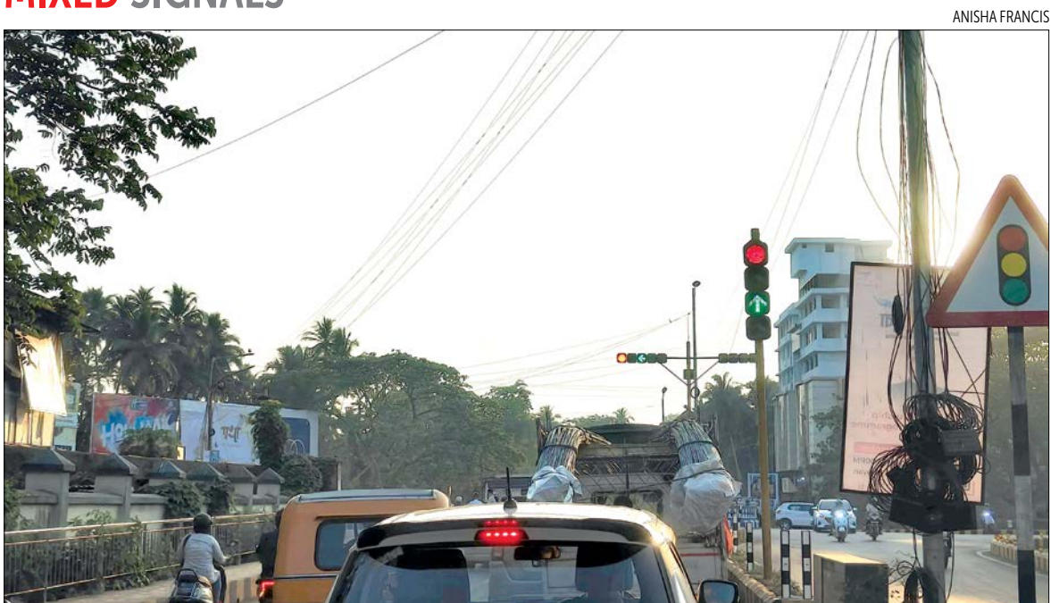
For months now, a the second traffic signal installed at the Old Market Circle, Fatorda-Margao, ostensibly for motorists who may not be able to see the main signal at the junction, has been simultaneously flashing red (stop) and green (go) lights leaving drivers confused – and serving little purpose

tion by the authorities has sparked concerns among residents about the responsiveness of law enforcement in handling such violent incidents. Authorities are expected to take further action as the investigation progresses.