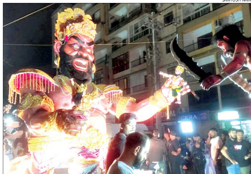
A float showcasing a mythological scene ambles along a street during the annual Shigmo parade in Ponda, on Saturday, marking the start of the 14-day celebration