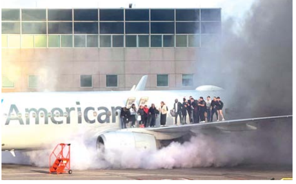
Passengers standing on the wing of an American Airlines plane as they are evacuated after it caught fire while at a gate at Denver International Airport in Denver, Colorado

Photos and videos posted by news outlets showed passengers standing on a plane's wing as smoke surrounded the aircraft. The FAA said passengers exited