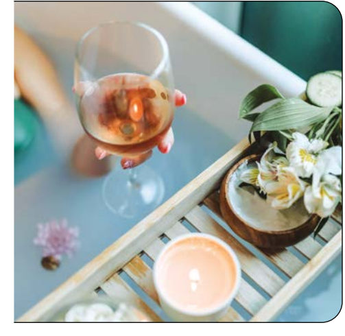
KEEP YOUR STRESS IN CHECK