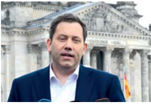
Chairman of Germany's Social Democratic Party (SPD) Lars Klingbeil gives a statement in front of the Reichstag in Berlin