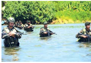
Guatemalan soldiers patrol the shared border with Mexico as part of the Ring of Fire operation, aiming to strengthen border control, in Guatemala