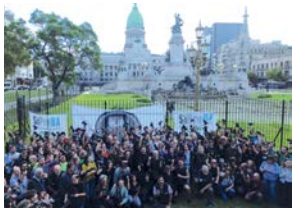
Members of the Argentina Association of Photojournalists (ARGRA) demonstrate outside Congress in Buenos Aires, Argentina