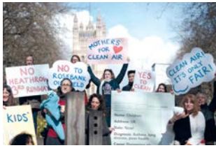
Placards are held up at a protest at home to the Houses of Parliament, in central London calling for urgent action on clean air, in London