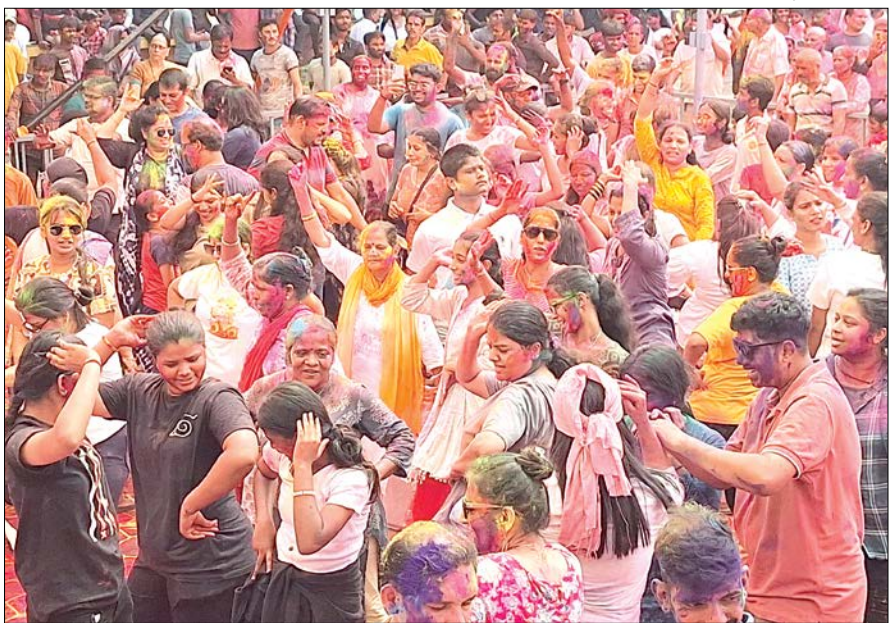
People participate in Holi celebration at Azad Maidan, Panjim on Friday. The festival was celebrated across the State with a splash of colours and camaraderie