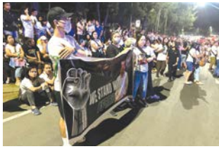
Philippines' former president Rodrigo Duterte's supporters gather for a peace rally at Kidapawan in province of Cotabato