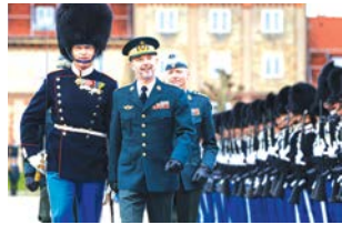
King Frederik X (R) of Denmark reviews soldiers of the Royal Life Guards during a parade at the Royal Life Guards Barracks in Copenhagen, Denmark