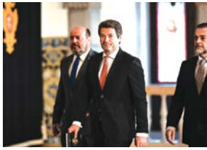
Portuguese far-right party Chega leader Andre Ventura (C) arrives for a meeting with Portuguese President at Belem Palace in Lisbon