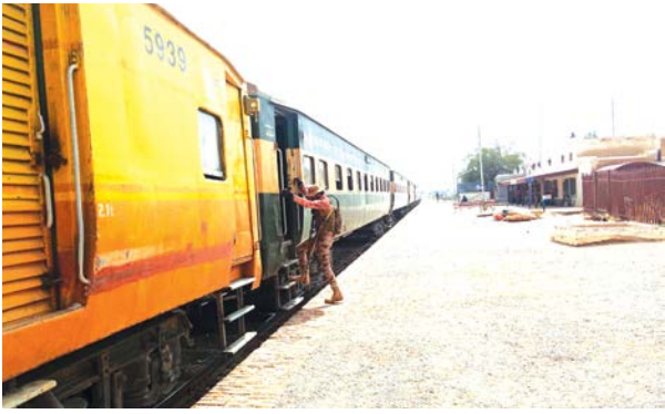
A paramilitary soldier takes position at a railway station near the attack site of a passenger train by insurgents, in Mushkaf in Bolan district of Pakistan's southwestern Balochistan province

The Jaffar Express, carrying 440 passengers in nine coaches, was going from Quetta to Peshawar when militants derailed it using explosives and hijacked it near the mountainous ter-