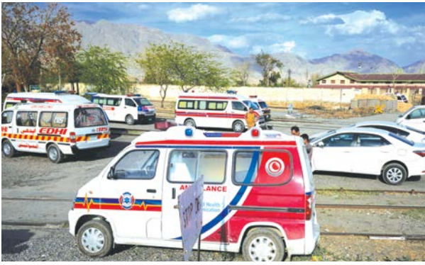
Ambulances park outside a railway station where rescued and injured passenger of a train attacked by insurgents are brought in Much, Pakistan's southwestern Balochistan province

Sharif said that forces took time to complete the