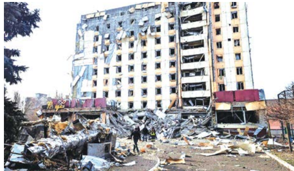
Shows a destroyed building at the site of a strike in Kryvyi Rig, amid the Russian invasion of Ukraine

US Secretary of State Marco Rubio, who led the American delegation to Tuesday's talks in Saudi Arabia, said that Washington would present the ceasefire offer to the Kremlin.