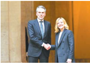
Italy's Prime Minister, Giorgia Meloni welcomes Dutch Prime Minister Dick Schoof at Palazzo Chigi prior to their meeting in Rome