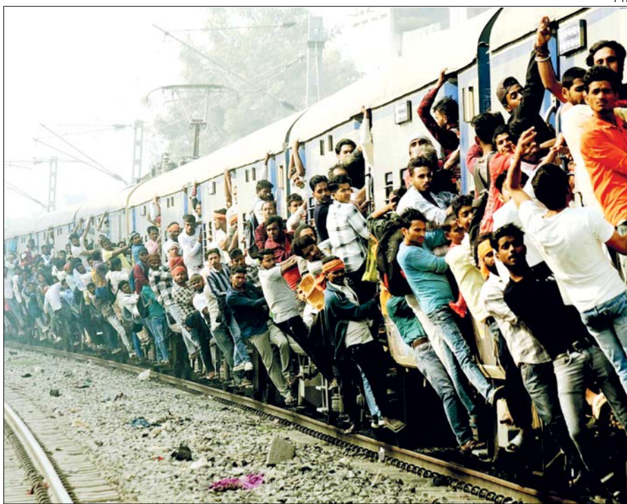
Passengers aboard an overcrowded train amid rush ahead of the Holi festival, in Patna, Tuesday