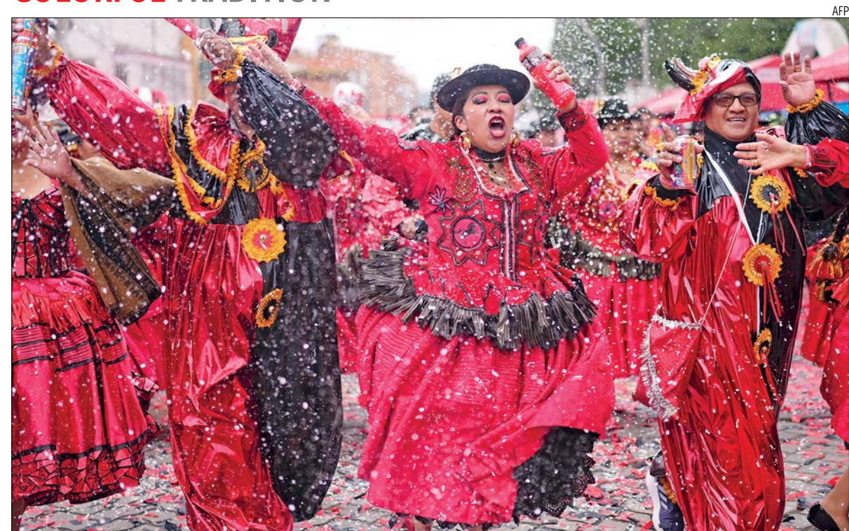
Dancers representing the characters of Chola and Pepino perform at the closing ceremonies of Carnival in La Paz, Bolivia

All three excavators functioning inside the tunnel have cleared most of the metal debris and are about 100 metres away from the tail end of the Tunnel Boring Machine (TBM), he said.