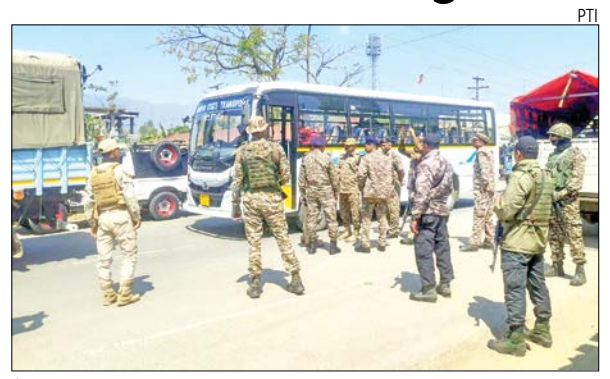
Security personnel stand guard during an indefinite shutdown by the Kuki Zo Council in all the Kuki areas, in Manipur