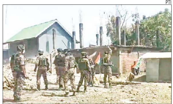
Security personnel stand guard during an indefinite shutdown by the Kuki Zo Council in all the Kuki areas, in Manipur.

"We are working in close coordination with law enforcement agencies, civil society organisations and community leaders to restore peace and normalcy,"