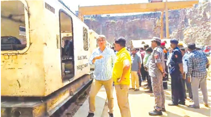
Rescue operation underway to trace workers trapped inside the partially collapsed Srisailem Left Bank Canal project tunnel, in Telangana, on Sunday

following "very careful" digging and other efforts for more than 48 hours, he said. It was buried under silt at a depth of about 10 feet. Efforts were on to ascertain the identity of the deceased, a police official said. The rescue officials appreciated the role of personnel of NDRF, state-run miner Singareni Collieries Ltd and rat miners in the operation. The search for the remaining workers continues as it is,