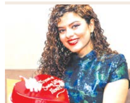
Singer Palak Muchhal celebrates 25 years of her initiative 'Saving Little Hearts', which helps children with heart diseases get life-saving surgeries, in Mumbai