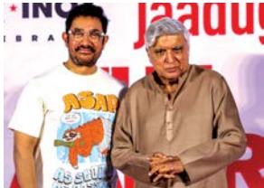
Actor Aamir Khan and screenwriter Javed Akhtar during the announcement of film festival 'Aamir Khan: Cinema Ka Jadugar', in Mumbai