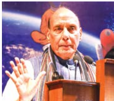
Defence Minister Rajnath Singh at the opening of Centre for Advanced Research on Space Psychology, at the Institute of Aerospace Medicine of the IAF, in Bengaluru