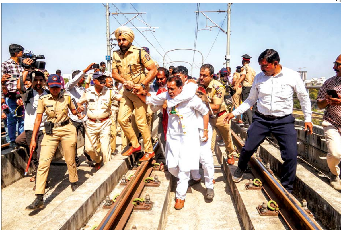
Police detain members of the NCP (Sharad Pawar) who were staging a protest demanding employment opportunities for local candidates in the Pune Metro and Pune Municipal Corporation, in Pune, on Sunday