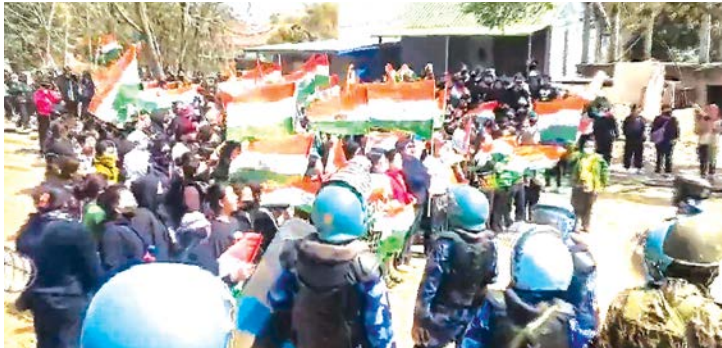
Security personnel stand guard during an indefinite shutdown by the Kuki Zo Council in all the Kuki areas, in Manipur

onstrators and security forces in the Kuki-dominated district after police fired tear gas shells to disperse them, as they opposed Union Home Minister Amit Shah's directive allowing free movement across the state.