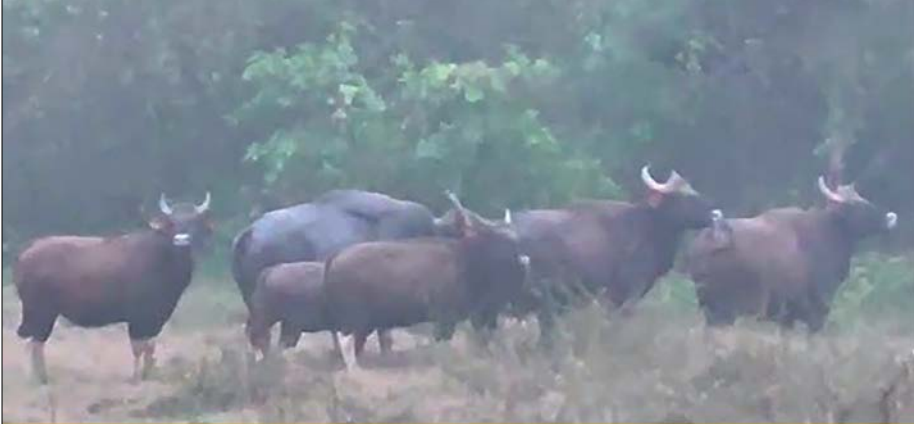
marauding herds of bison.

pigeons. Sugarcane, bananas, coconut saplings, pulses, chillies, seasonal vegetables, and other crops are destroyed overnight, plunging farmers into colossal losses. In fact, the entire Pernem taluka has been at the mercy of wild animals, with the maximum crop damage being inflicted by