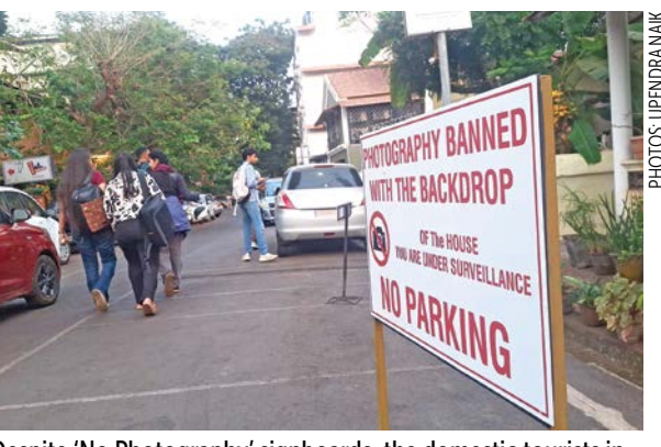
Despite 'No Photography' signboards, the domestic tourists in particular often disregard community concerns and privacy in pursuit of the perfect shot

resident of the area, said, "We have put up posters asking people not to take photographs is not because we are against photography. The kind of crowd visiting Fon-