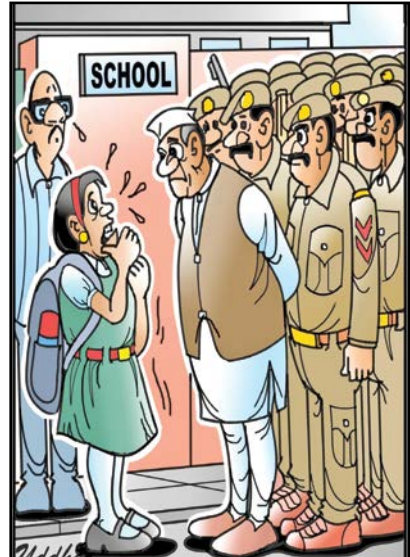
Uncle, spare me just one guard?