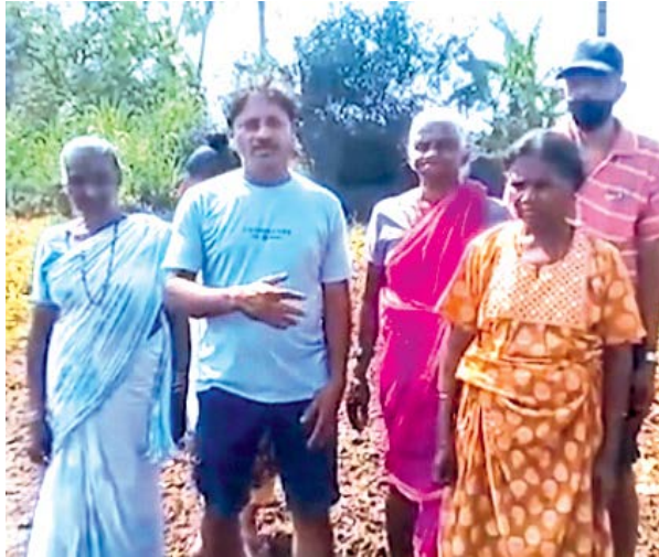
Ryots demand compensation for their damaged crops that have been submerged under water