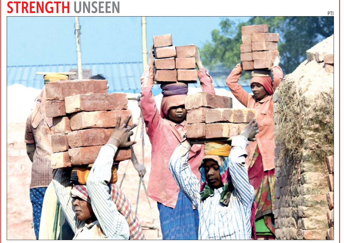
Women labourers work at a brick kiln on the eve of the International Women's Day, in Patna, Bihar

EC functionaries pointed out that no appeals were filed in West Bengal.