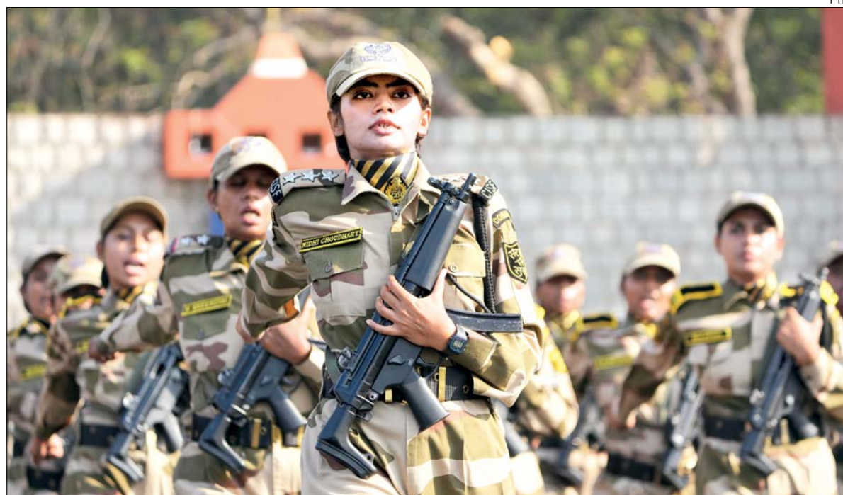
Central Industrial Security Force (CISF) women personnel march during the 56th CISF Raising Day Parade in Ranipet district, Tamil Nadu, on Friday