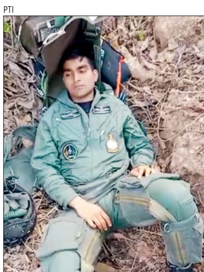
Pilot of a Jaguar aircraft of the IAF that crashed in Panchkula, Haryana, on Friday

Jaguar fighter jet crashes in Haryana, AN-32 aircraft in WB; crew eject safely in both cases