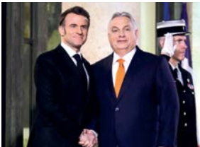
French President Emmanuel Macron (L), welcomes Hungarian Prime Minister Viktor Orbán at the Elysee Palace, in Paris