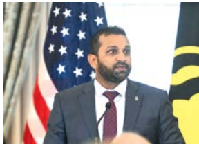
FBI Director Kash Patel speaks during a US hostage and wrongful detainee flag raising ceremony at the State Dept in Washington, DC