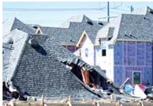
Homes that were under construction sit destroyed after recent severe weather passed through the area in Haslet, Texas