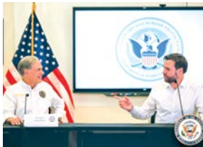
Vice Prez JD Vance talks with Texas Gov Greg Abbott at the Border Patrol Station South during a visit to the US border with Mexico in Eagle Pass, Texas