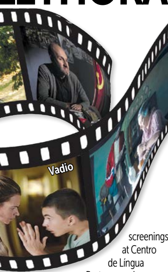
screenings at Centro de Língua Portuguesa do

Ten feature films will be screened at the Maquinez Palace till March 9, with free entry for all attendees. The festival will continue from March 10 to 16, featuring special