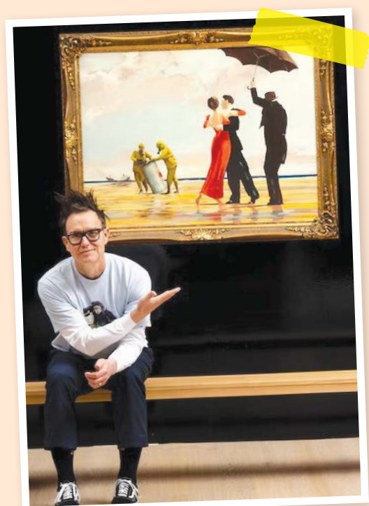
'Blink-182' rocker Mark Hoppus recently unveiled a Banksy piece from his own private art collection as part of a Sotheby's auction benefitting victims of the LA wildfire.

Roberto Benigni shot into the international limelight when 'Life is Beautiful' which he directed, wrote, and starred in, won two Oscars at the 71st Academy Awards for Best Foreign Language Film and later in the evening for Best Actor. Benigni's real life wife Nicoletta Braschi was by his side when he started dancing on the tops of chairs as he won the Oscar for Best Foreign Language Film. He hopped around with both his feet to jump up each step to retrieve his award from legendary Italian actress Sophia Loren. He bowed to the audience before delivering a powerful speech recognizing the victims of the Holocaust who inspired the film. When he won the Best Actor award, he said, "This is a terrible mistake because I used up all my English. I don't know!"