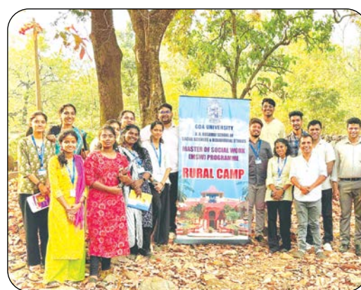
MSW STUDENTS DRIVE EMPOWERMENT AT RURAL CAMP 2025

As the music began playing in the background, he said, "I'm wrapping up. I will wrap up. Please turn the music off. I've done this before — thank you. It's not my first rodeo. I'm here once again to represent the lingering traumas, and the repercussions of war and systematic oppression, and of anti-semitism, and racism, and of othering, and I believe that I pray for a healthier and happier, and a more inclusive world, and I believe if the past can teach us anything, it's a reminder to not let hate go unchecked. Let's fight for what's right, keep smiling, keep loving one another, let's rebuild together. Thank you."