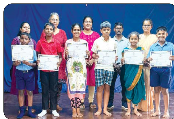
INTERNATIONAL MOTHER TONGUE DAY CELEBRATED AT ASSUMPTA CONVENT HS, SARZORA