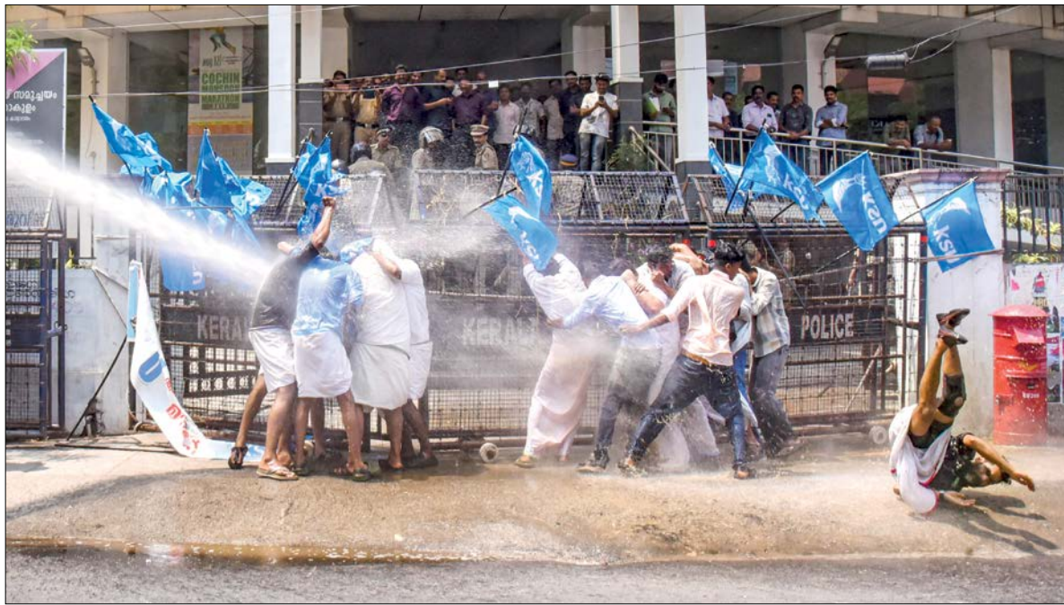
Police personnel use water cannon to disperse members of Kerala Students Union (KSU) during their protest demanding government action against alleged drug mafia in Kerala, Kochi, Thursday