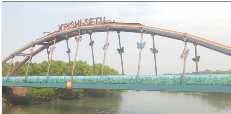
The 50-metre single span arched bridge built by Goa State Infrastructure Development Corporation at a cost of Rs 3 crore, at Gandaolim in Cumbarjua. (Top right) The gated entry point preventing free access to the bridge

Cumbarjua Sarpanch Sachin P Gaude, however, questioned the farmers for not using the