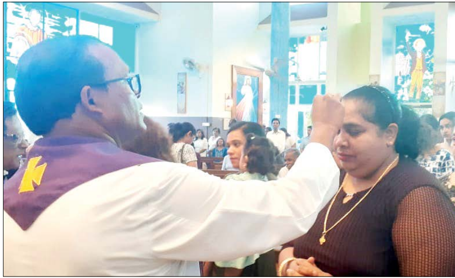
A priest applies ashes to a devotee's forehead in the shape of a cross to symbolise repentance for sins on the occasion of Ash Wednesday at Our Lady of Fatima Shrine, Panjim