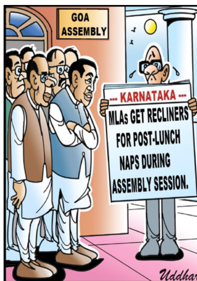
Recliners are useless for us, with sessions curtailed!