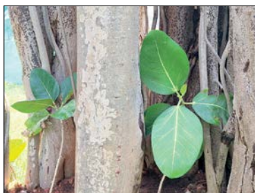
New shoots have come out from tree's roots

Campal and planted. However, when the authorities realised that a temple was coming up there they changed its location. Then I got involved. Since it