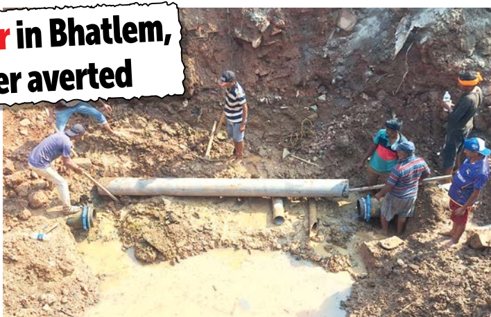
Workers carry out repair works of the water pipeline which was damaged at Mala, Panjim on account of the debris allegedly dumped by contractors engaged in the Smart City works. Water supply was disrupted, affecting the residents of Mala, Neugi Nagar, Fontainhas and Sao Tome

The debris had been picked up from St Inez, where a reportedly unauthorised restaurant was demolished a few days ago. According to residents, this debris was then picked up and allegedly dumped by Smart City contractors in Mala, damaging the water pipeline and