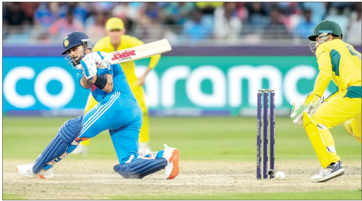
A measured 84-run knock by run machine Virat Kohli steered India into their fifth Champions Trophy final with a clinical four-wicket win over an under-strength Australia in the first semi-final clash in Dubai on Tuesday