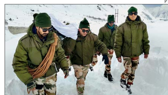
Rescue operation underway after an avalanche in Mana area of Chamoli district, on Saturday

and 6 am on Friday, burying 55 workers inside eight containers and a shed, according to the Army. Thirty-three of them were rescued by Friday night and 17 on Saturday. Rain and snowfall hampered the rescue efforts on Friday, and the operation was suspended as the night fell.