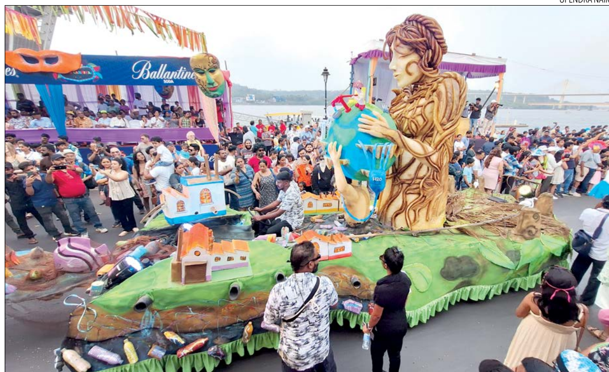
A float depicting Mother Nature winds its way along the D B Marg opposite the Old Secretariat, Panjim, on Saturday