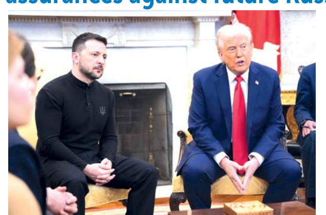
US President Donald Trump greets Ukrainian President Volodymyr Zelensky meet in the Oval Office at the White House, in Washington, DC

Oval Office, Trump said the agreement would be signed soon in the East Room of the White House. "We have something that